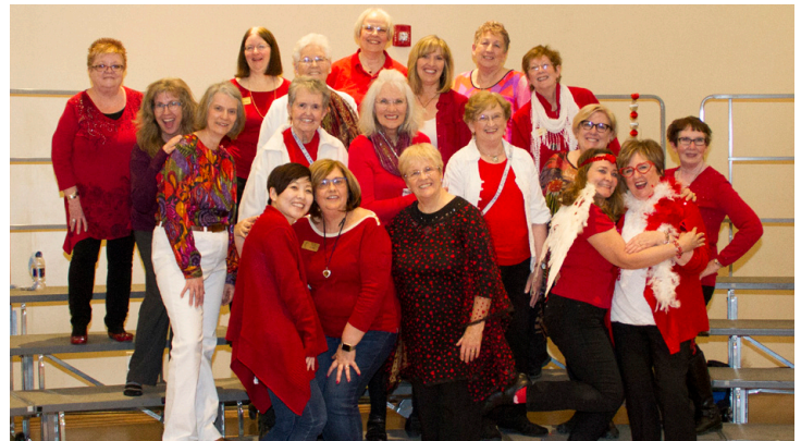
Alberta Gold Chorus celebrates Valentine's Day with friends, fun, and music.