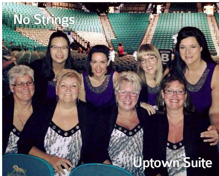
No Strings and Uptown Suite in Las Vegas.

Before we walked on stage, we were already celebrating the fun and laughter we shared, and the time and effort that we put in between April and October.