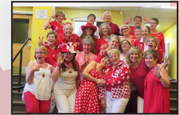
Alberta Gold Chorus - Celebrated their Summer Installation party Canadian style!