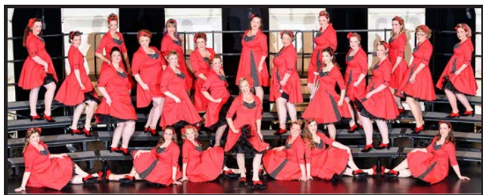
Wildcard Entry - Vocal Motion! Chorus.