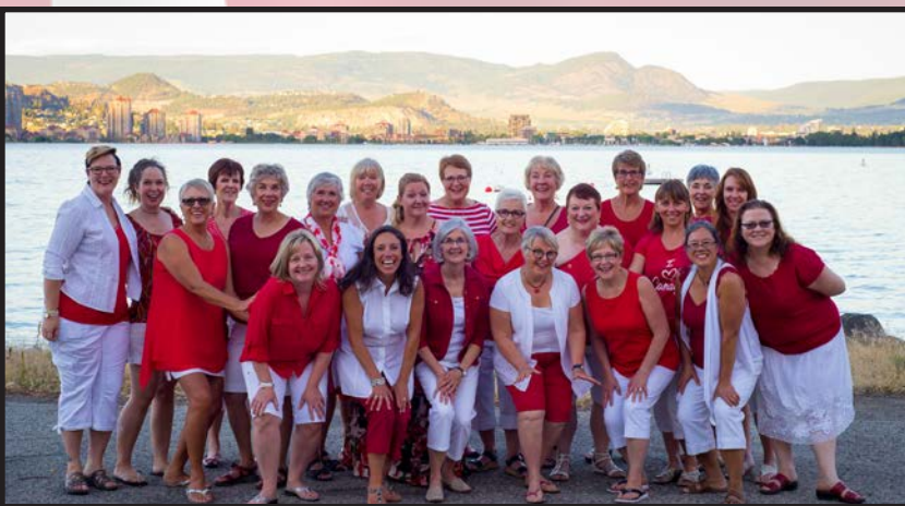
Kelowna White Sails A Cappella Chorus - The week before, we met at our usual rehearsal time, but not at our rehearsal hall, but rather on the shores of the beautiful Okanagan Lake overlooking the City of Kelowna. We video recorded "Oh Canada" and took pictures of our amazing group of women all decked out in red and white. The video and a picture were sent to several local media and organizations to help celebrate Canada Day.

Editors Note: Check out their video at: https://youtu.be/fEc-mw1AKes