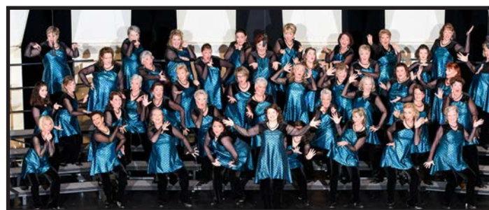
Region Champions - Westcoast Harmony Chorus.