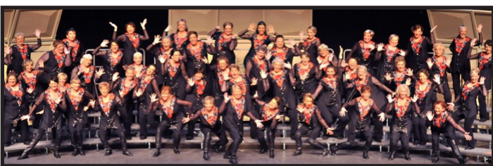
Wildcard Entry - Rhythm of the Rockies Chorus - Appearing #21