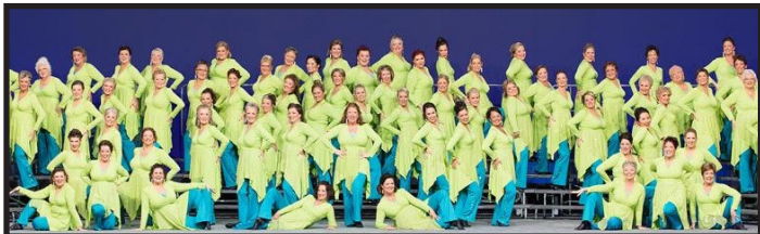
Region Champions - Lions Gate Chorus - Appearing #22