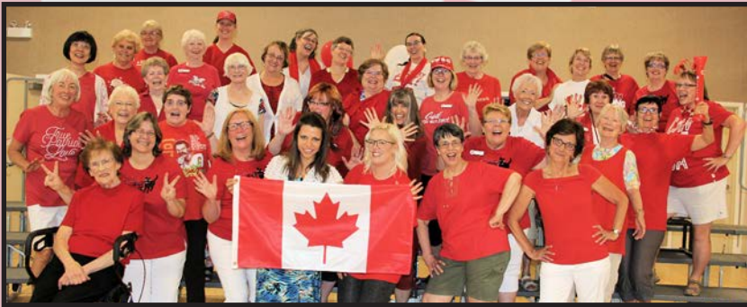
Chinook Winds Show Chorus - Fun Fact: The two members holding the flag are from Russia and Sweden!