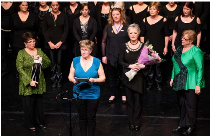
Regional Committee who developed the A.C.E. Award

I am settling here in my new house in Middle Sackville, Nova Scotia - part of the Halifax Regional Municipality (HRM). HRM apparently does not stand for Her Royal Majesty here. :-) My new house is on a charming little lake where my neighbours fish and kayak and water ski. We spend a fair bit of time watching 'Lake TV' from the kitchen deck, and it's our favourite channel so far. We even have a couple of loons making their lonely calls at dawn and dusk. It's a pretty spectacular location - a dream, really. My parents have relocated from Alberta and are busy moving into the lower level of the house, and I've seen my brother and his family several times a week so far, plus other cousins who live in the area. It's so nice to be close to family for the first time in my adult life. Family is probably the only thing that could lure me away from my barbershop life in Vancouver and Region 26. I will miss all of you - I already do - but I feel comfortable that I've done the right thing moving here while I'm still (in theory) young enough to build a second life.