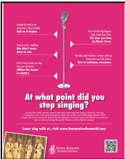
Sample SAI Poster

A reminder that the video submissions deadline is September 1, 2018. We're getting very excited to see your videos! If you have any questions about the Video Contest, please send me an email at region26contest@gmail.com .