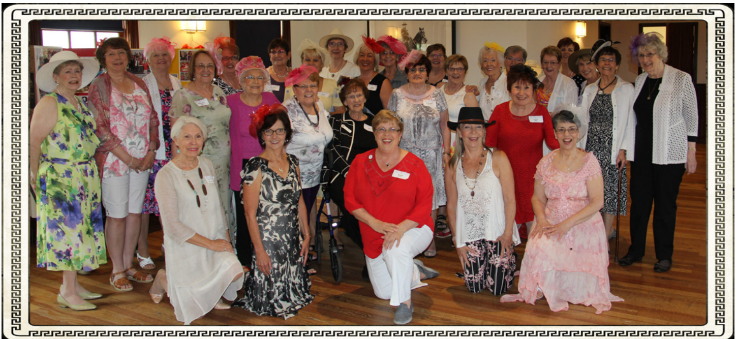
29 newly recognized Chinook Winds Show Chorus Legacy Members.