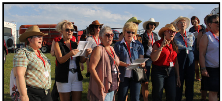
Rehearsal at the Thursday night Stampede BBQ at Fort Calgary.