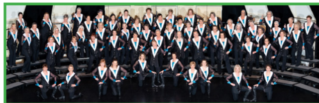
Rhythm of the Rockies Chorus, Calgary, AB