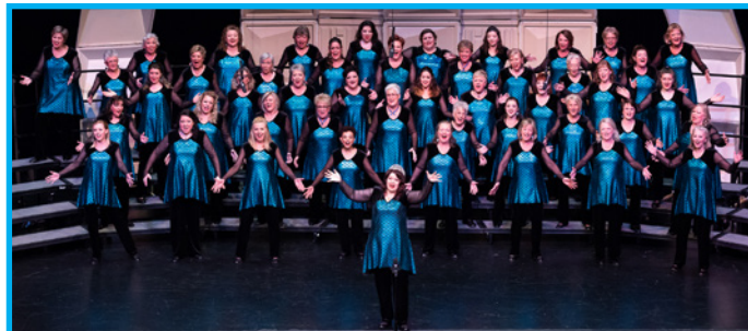
Westcoast Harmony Chorus #22 International Chorus