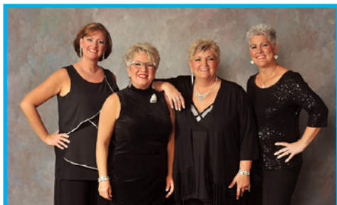
2018 International Quartet Competition - Uptown Suite! #37

Editor's Note: The number following the chorus and quartet names is the order of their appearance on the international stage. For a complete list of participants please check out the Sweet Adelines International website at https://sweetadelines.com/competitionconvention/internationalcompetition/ .