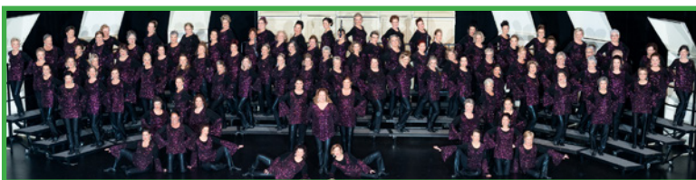
Lions Gate Chorus, Vancouver, BC

Off to the magical city of New Orleans, Louisiana for International Competition in 2019 from September 16 to 21 are Lions Gate Chorus and Rhythm of the Rockies. We will have to wait until our Regional Contest in 2019 to see which quartet(s) will be joining our awesome choruses!