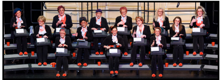
Audience Choice recipients River Hills Chorus.