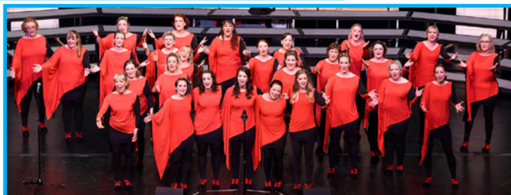
Vocal Motion! Chorus #3 Harmony Classic Division A

Heading for Sweet Adelines International 2018 in St. Louis, Missouri are Vocal Motion Chorus, Westcoast Harmony Chorus and Uptown Suite! Quartet. You can catch the action live at www.sweetadswebcast.com .