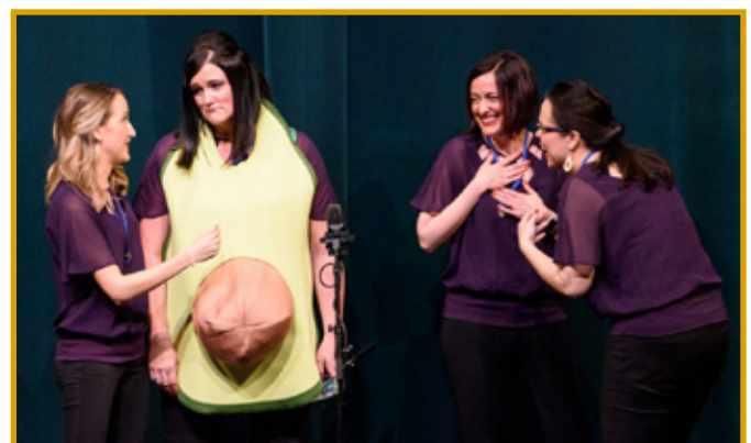
No Strings Quartet, Region 26 Champions are heading for New Orleans! As for the status of the avocado, that’s still unknown.