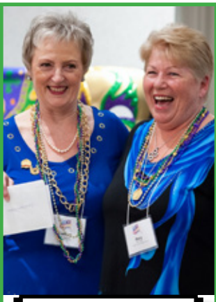
Off to New Orleans!