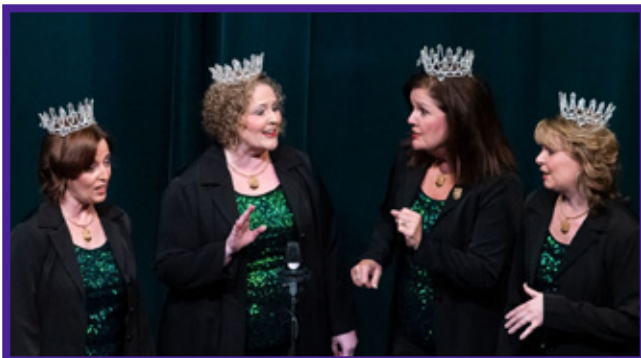
Martini live and in person at the Show of Champions.