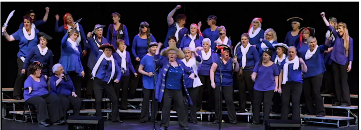
Members of the Hearts of Harmony Chorus transformed into pirates in front of the eyes of their highly entertained audience during their December 2018 Singin’ the Dream show.