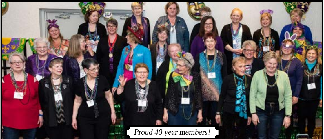
Proud 40 year members!